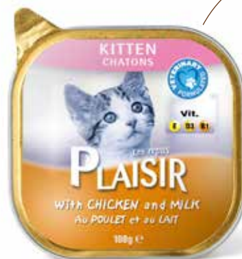
with chicken & milk