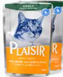
with chicken and liver