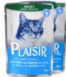
with trout and shrimps