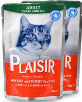
with beef and turkey