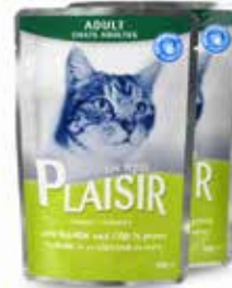
with salmon and cod